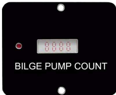
3" x 2-1/2"