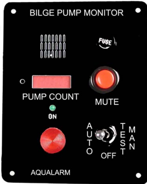
4-3/4" x 3-7/8"

This Bilge Alarm is the ultimate in monitoring the bilge area. It lights the Red Light when the bilge pump comes on and then activates a panel mounted, loud buzzer when the bilge pump runs longer than two minutes.....indicating excessive pumping (when used with the Aqualarm Smart Bilge Pump Switch, #20038). Each time the pump cycles the built-in Bilge Pump Counter counts and accumulates the frequency of pumping.